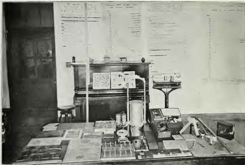
PSYCHOLOGICAL AND ANTHROPOMETRIC APPARATUS IN THE PSYCHOLOGICAL LABORATORY AND CLINIC